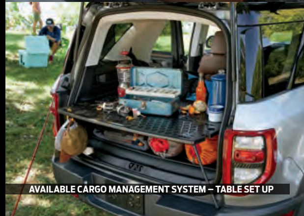
AVAILABLE CARGO MANAGEMENT SYSTEM – TABLE SET UP