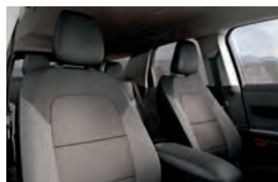
Medium Dark Slate Easy-Clean Cloth / 1-11 Big Bend