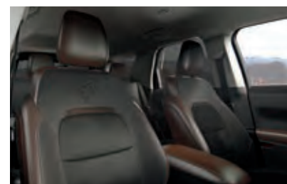
Ebony & Roast Leather-Trimmed / 1-11 Outer Banks