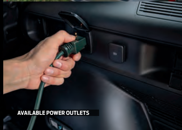
AVAILABLE POWER OUTLETS