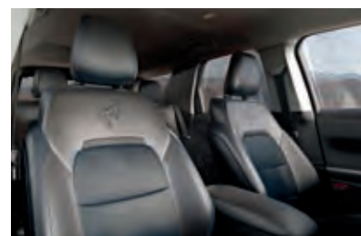
Navy Pier Leather-Trimmed / 1-11 Outer Banks