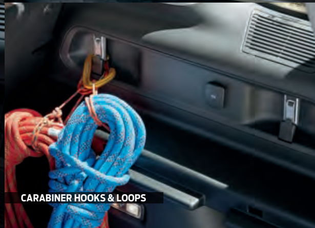
CARABINER HOOKS & LOOPS