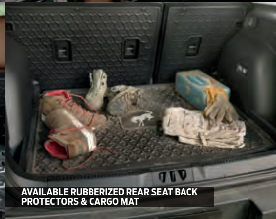
AVAILABLE RUBBERIZED REAR SEAT BACK PROTECTORS & CARGO MAT