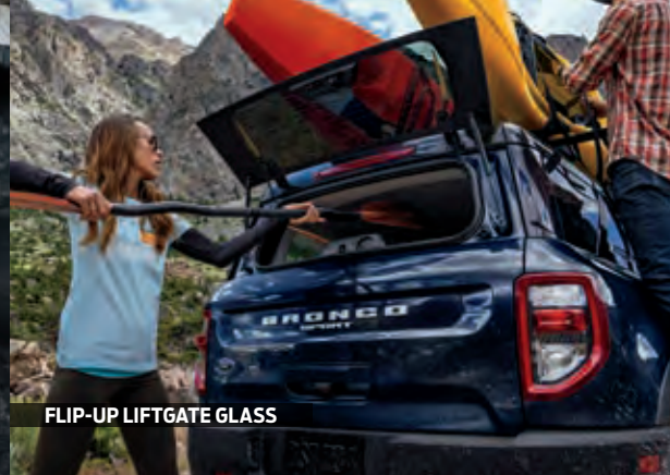
FLIP-UP LIFTGATE GLASS