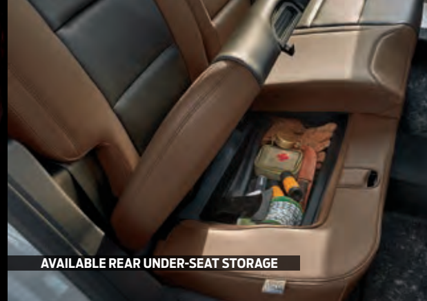
AVAILABLE REAR UNDER-SEAT STORAGE

1. Cargo and load capacity limited by weight and weight distribution.