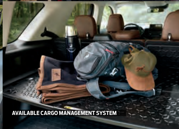
AVAILABLE CARGO MANAGEMENT SYSTEM