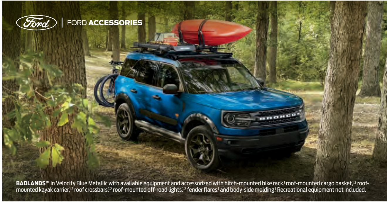
BADLANDS™ in Velocity Blue Metallic with available equipment and accessorized with hitch-mounted bike rack, 1 roof-mounted cargo basket, 1,2 roof-mounted kayak carrier, 1,2 roof crossbars, 1,2 roof-mounted off-road lights, 1,2 fender flares, 1 and body-side molding. 1 Recreational equipment not included.