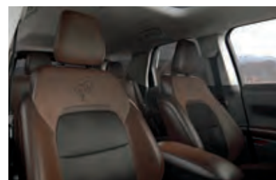
Ebony & Roast Leather-Trimmed / 1-11 Badlands with Premium Package

Colors are representative only. See your dealer for actual paint/trim options. 1. Additional charge.