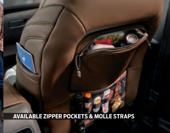
AVAILABLE ZIPPER POCKETS & MOLLE STRAPS