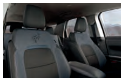
Ebony & Area 51 Cloth / 1-11 Badlands