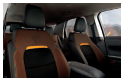
Ebony & Active Orange Cloth / 1-11 Badlands